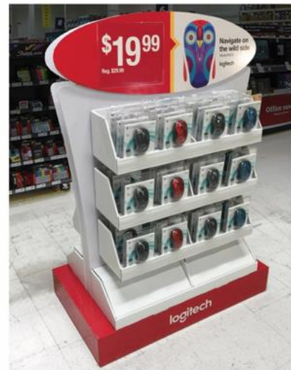
A 2016 Design of the Times award-winning display for Logitech

Logitech is a global provider of personal computer and mobile accessories. Since December of 2009 Logitech has been in a growth mode, having partnered with companies such as Google, acquired companies such as Ultimate Ears, or had new product launches for Jaybird occur almost annually. With each change to Logitech's portfolio of products, Great Northern has been there every step of the way by offering mixed material packaging and display solutions. The keys to success with Logitech are our unrelenting Customer Service at every level and phase of a given project, and our expertise in the consumer electronics market.