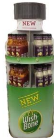
A recent project for Pinnacle was the Wishbone Launch Bottle Floorstand

Pinnacle Foods is a rapidly growing CPG with over 30 very strong iconic brands such as Duncan Hines, Wish-Bone, & Birds Eye. It's hard not to find a Pinnacle Foods brand in every aisle of the grocery store. Through organic growth, as well as acquisitions, Pinnacle has continued to stay ahead of its competitors in the highly commoditized Packed Food segment of the marketplace. Great Northern has designed and produced traditional corrugated displays for most of the Duncan Hines line of products, as well as being a key driving force behind the launch of the E.V.O.O. brand. Since the start of our relationship with Pinnacle in 2012, our business has grown to include Turnkey Services such as assembly & packing. Going into 2017, Great